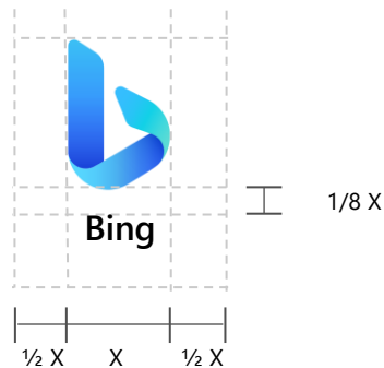
Minimum clear space with name