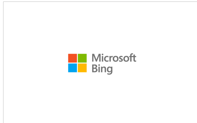
Stacked logo – On light backgrounds, use the version with logotype in gray