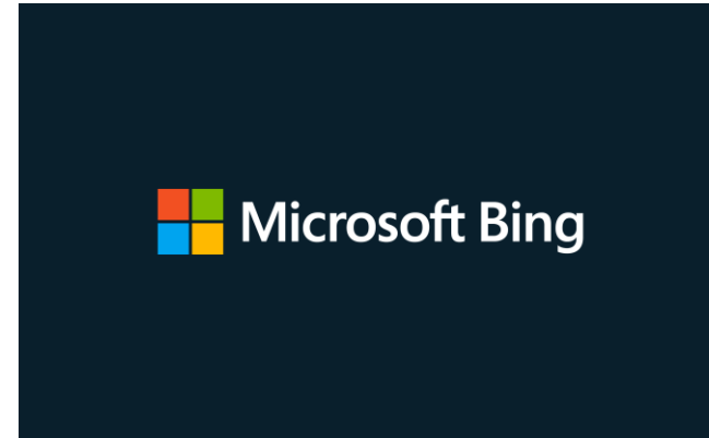
Horizontal logo – On dark backgrounds, including dark areas in photographs, use the version with logotype in white