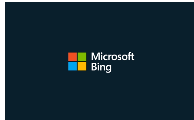
Stacked logo – On dark backgrounds, including dark areas in photographs, use the version with logotype in white