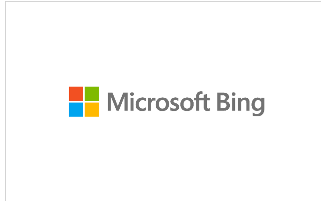
Horizontal logo – Preferred versus stacked logo

Use in full color in all instances unless there is a production limitation.